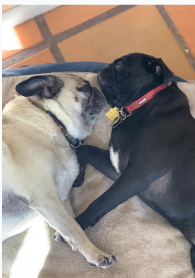
Ernie and Max